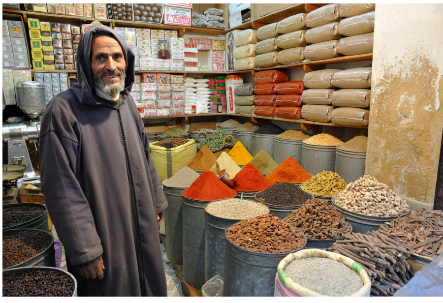
Figure 1: Spice seller in the medina of Fes, Morocco.