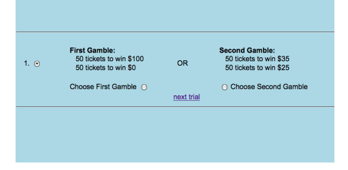
Figure 1: The appearance of one choice trial.

of these lucky people, you will get to play the gamble you chose on the trial selected. You might win as much as $100. Any one of the choices might be the one you get to play, so choose carefully." After each study, prizes were awarded as promised.